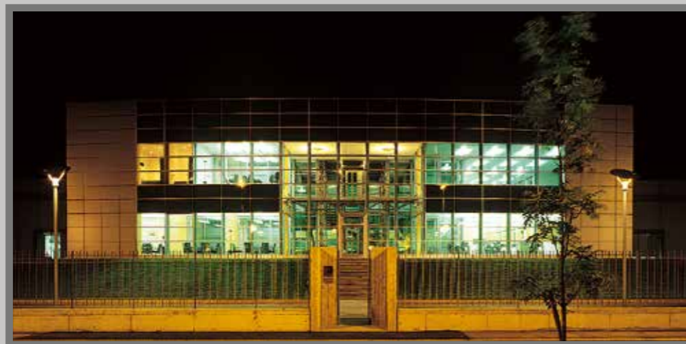
1944 - The first production site

Over the years, Vergnano has constantly innovated its product range to meet the demands of a continuously evolving market while keeping a firm foothold in the honored tradition of the Vergnano brand.